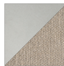
ALUMINIUM - LINEN SEAT Hecht-Johansen